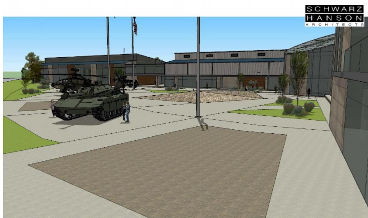
Memorial Bricks - Flag Plaza - Looking South

Complete this order form and submit along with payment to: The Museum of the American G.I., PO Box 9599, College Station, TX 77842 Make Checks Payable To: The Museum of the American G.I. Please email questions to: info@americangimuseum.org