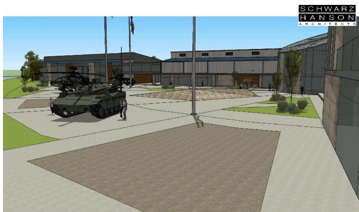
Memorial Bricks - Flag Plaza - Looking South